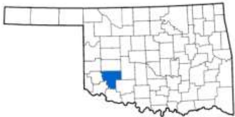
KIOWA COUNTY, OKLAHOMA